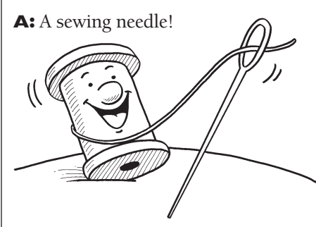
© 2018 Resources for Educators, a division of CCH Incorporated